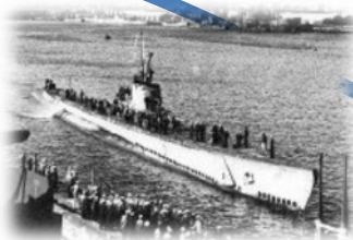
USS Bonefish SS-223