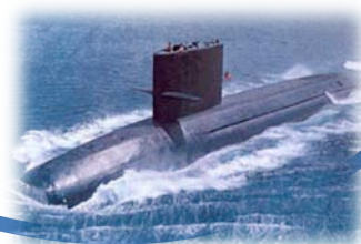
USS Bonefish SS-582