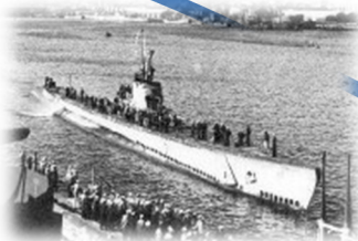
USS Bonefish SS-223