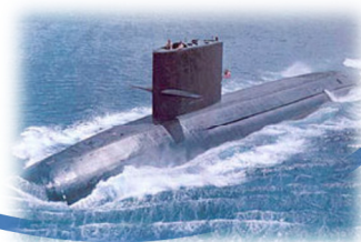
USS Bonefish SS-582